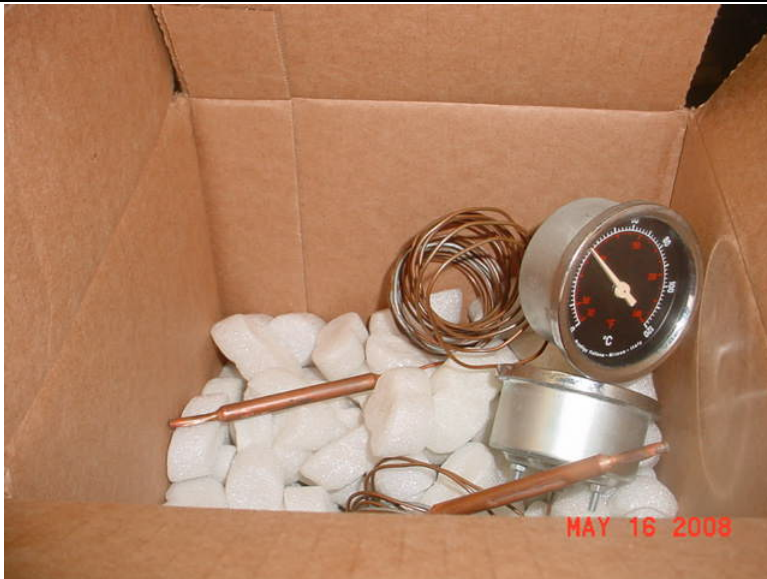
Two old gauges removed from dry cleaning machine.