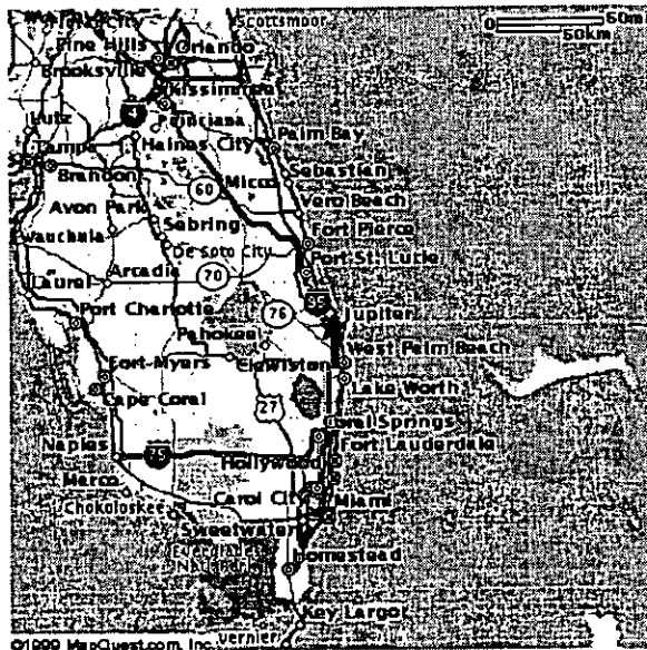
Figure 1 – Jupiter, Florida

The existing facility is located at 17900 Beeline Highway (SR 710) near Jupiter, Palm Beach County. The proposed LOX/Kerosene Rocket Test Stand will be located at the E-5 rocket test area. The facility is located more than 100 kilometers (62 miles) from the nearest PSD Class I area, Everglades National Park. The UTM coordinates of the site are Zone 17, 567.3 km East and 2974.4 km North.