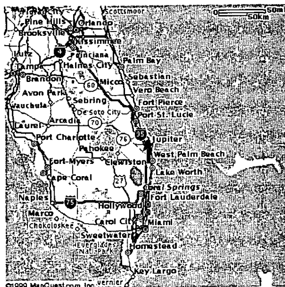
Figure 1 – Jupiter, Florida

The existing facility is located at 17900 Beeline Highway (SR 710) near Jupiter, Palm Beach County. The proposed LOX/Kerosene Rocket Test Stand will be located at the E-5 rocket test area. The facility is located more than 100 kilometers (62 miles) from the nearest PSD Class I area, Everglades National Park. The UTM coordinates of the site are Zone 17, 567.3 km East and 2974.4 km North.