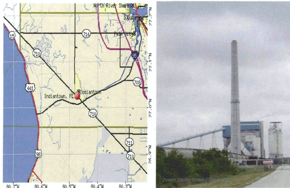
Figure 1. Map of Indiantown Site Location and Photograph of Indiantown Cogeneration Plant.

Indiantown Cogeneration, L.P. owns and operates the Indiantown Cogeneration Plant, a facility that generates electricity for sale and exports steam to the Louis Dreyfus Citrus Processing Plant. The facility includes one high-pressure pulverized coal main boiler (PC boiler), rated at 3,422 million British thermal units (MMBtu)/hour heat input, and has a nominal net electrical power output of approximately 330 megawatts (MW). It is permitted to fire natural gas, propane, or No. 2 fuel oil for startup, shutdown, or load changes. The unit is equipped with low nitrogen oxides (NO x ) burners, overfire air, a steam coil air heater and air preheater, dual register burners and windbox design, a selective catalytic reduction system, a spray dryer absorber, and a fabric filter baghouse. Also included are two identical auxiliary boilers used for supplying steam to the steam host during times when the PC boiler is offline, as well as during PC boiler startup and shutdown periods. This facility is located 9 miles east of Lake Okeechobee, and 3 miles northwest of Indiantown, Martin County; Universal Transverse Mercator (UTM) Coordinates are: Zone 17, 422.3 km East and 2952.9 km North; Latitude: 27° 02' 20" North and Longitude: 80° 30' 45" West.