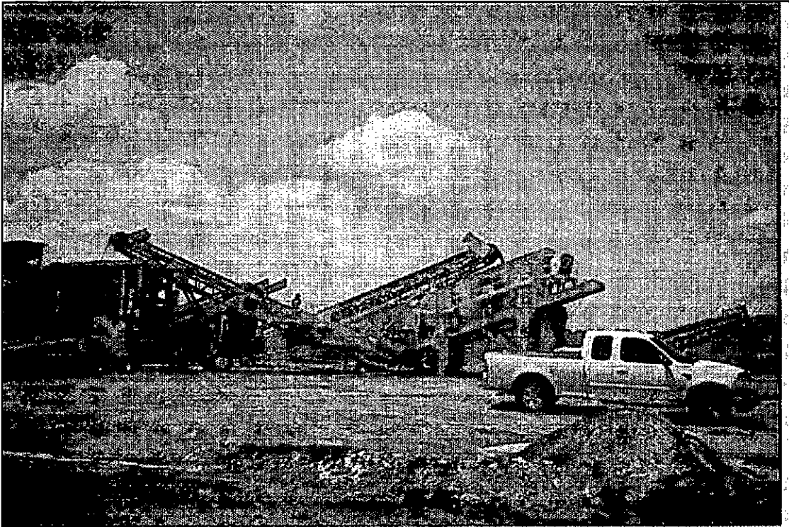
Photo of Hazmag 400 TPH relocatable crusher