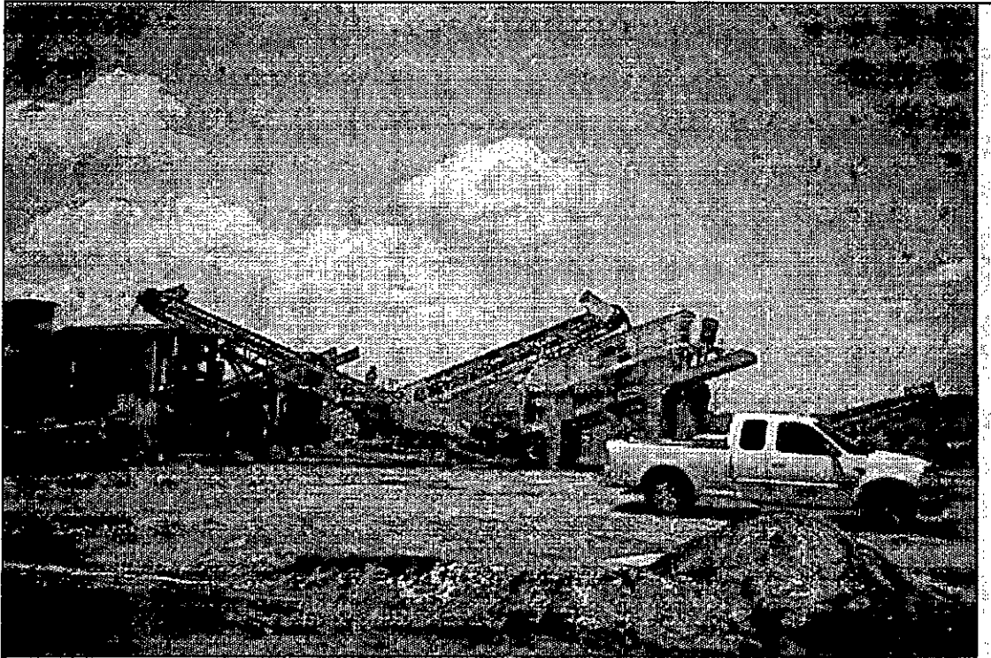
Photo of Hazmag 400 TPH relocatable crusher