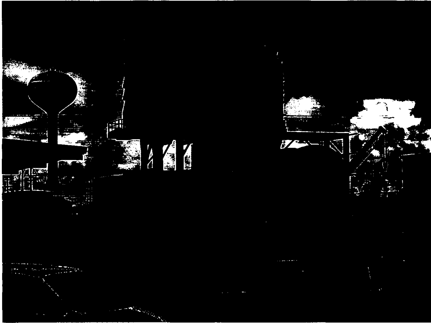
Photo 3. Lake Worth Generation