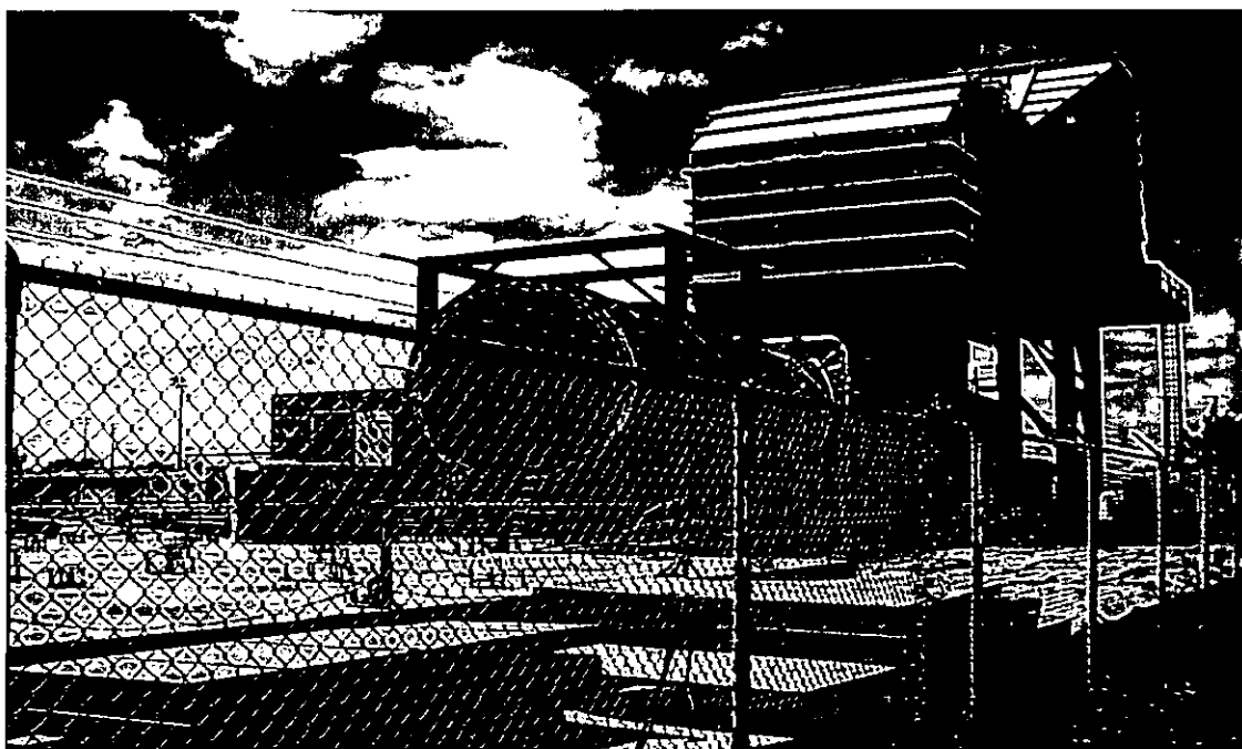
Photo 1. Lake Worth Generation