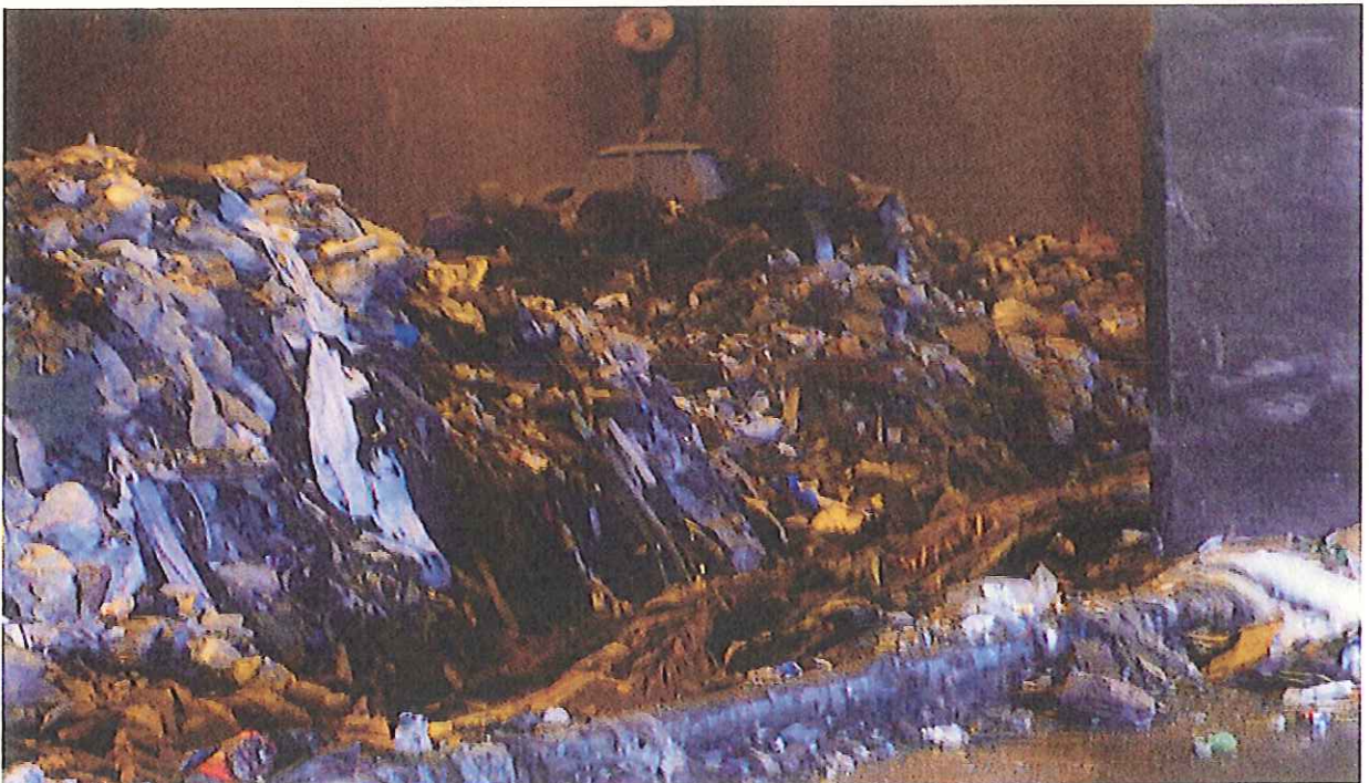
Waste Storage Bunker and Crane Grapple