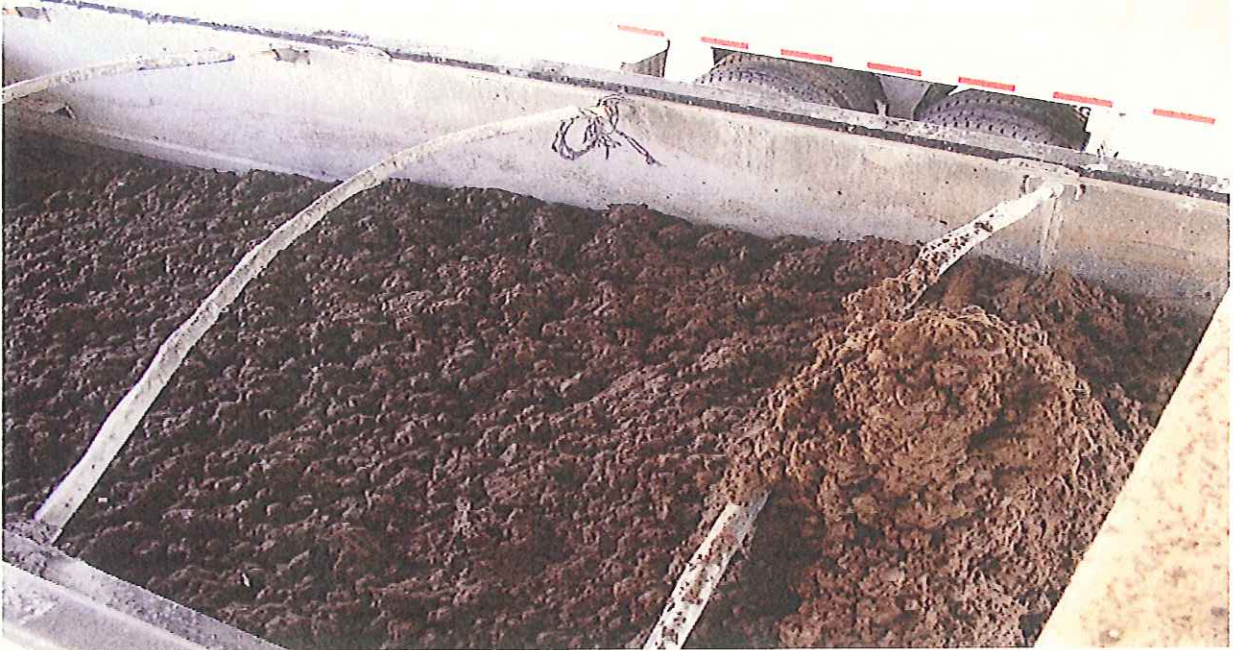
Biosolids in Truck