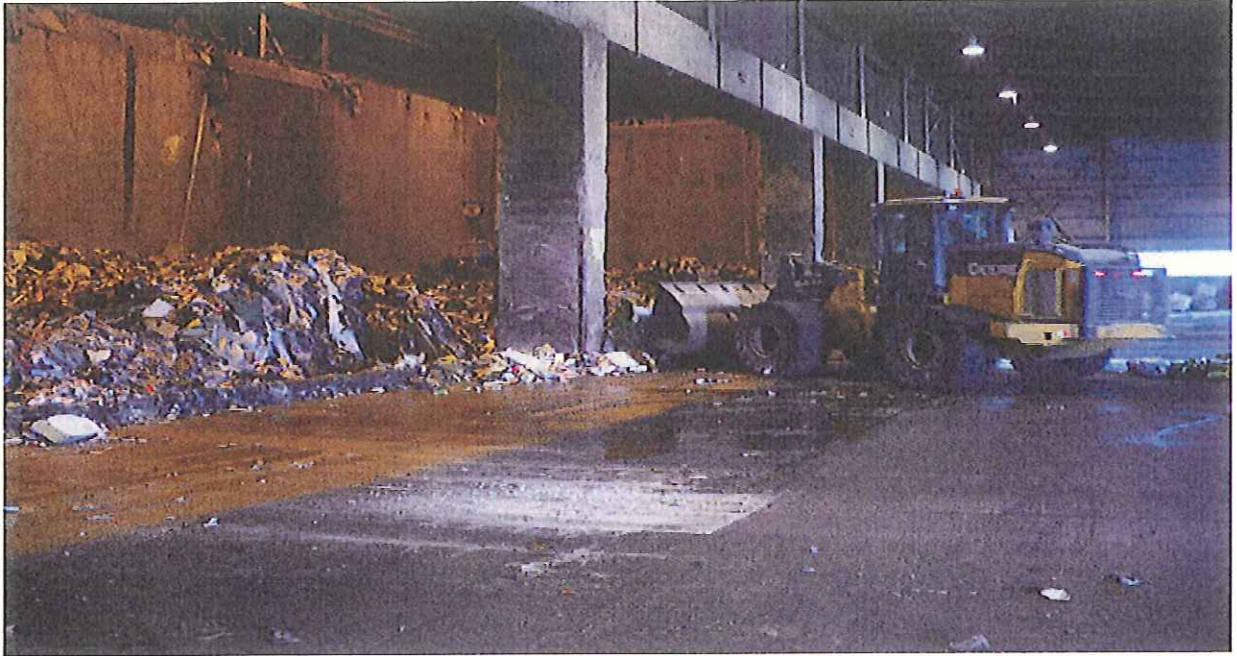
Tipping Floor and Waste Storage Bunker