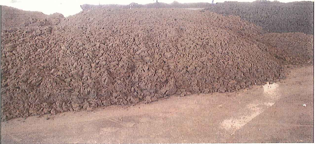
Biosolids on Compost Pad