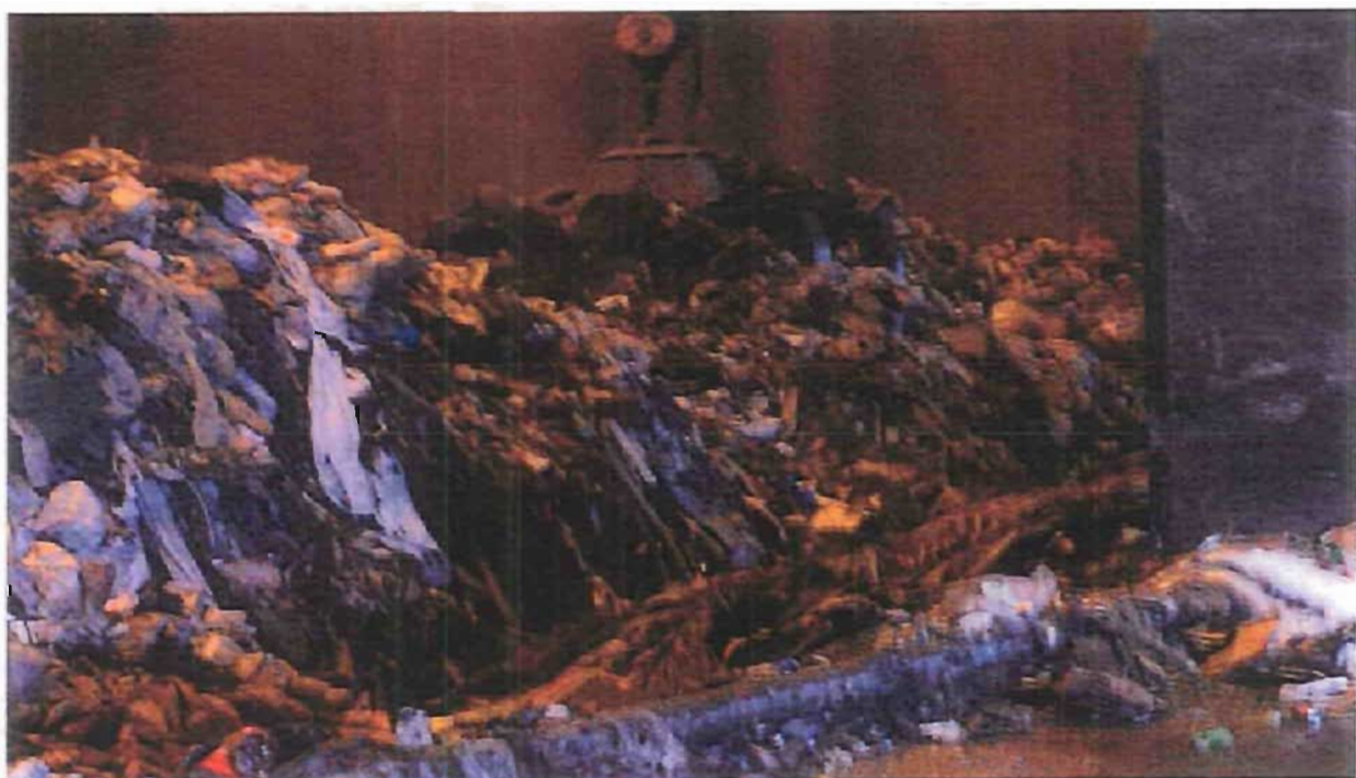
Waste Storage Bunker and Crane Grapple