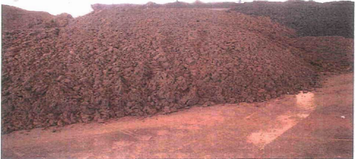
Biosolids on Compost Pad