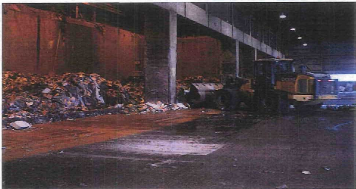
Tipping Floor and Waste Storage Bunker