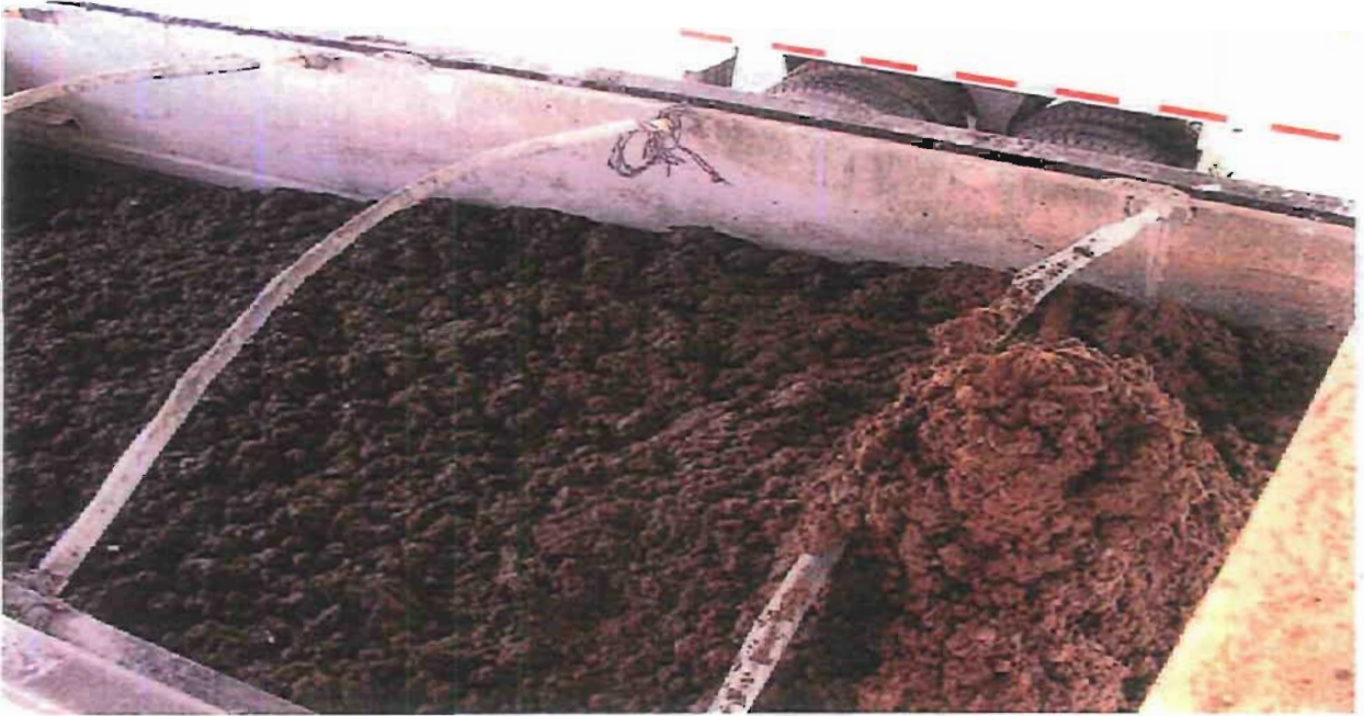
Biosolids in Truck