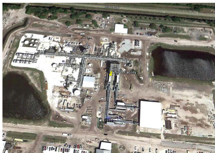
Figure 2– Aerial View of INEOS Bio Facility.