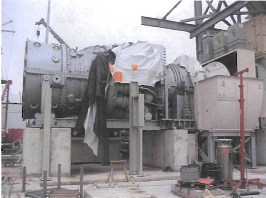
Picture #5. TECO Bayside Power Station New GE Combustion Turbine designated as CT#2D