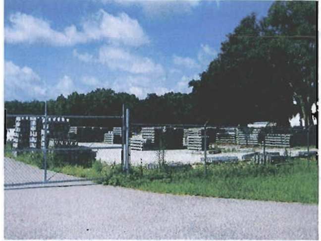
Photo ID No.6 7/14/11 11AM Barb-wire topped around back of site.