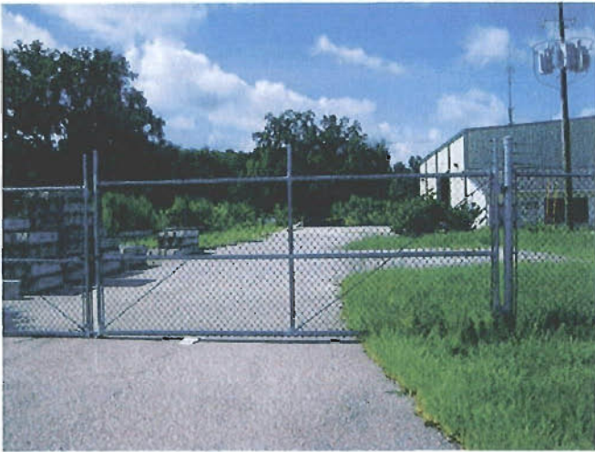
Photo ID No.1 7/14/11 11AM Concrete driveway and office with closed and locked gate.