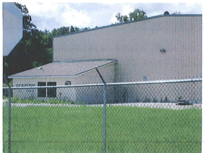
Photo ID No.4 7/14/11 11AM Main building from second entrance.

Facility Name: Pro-Crete Precast: Wildwood Plant Facility ID No. 1190047