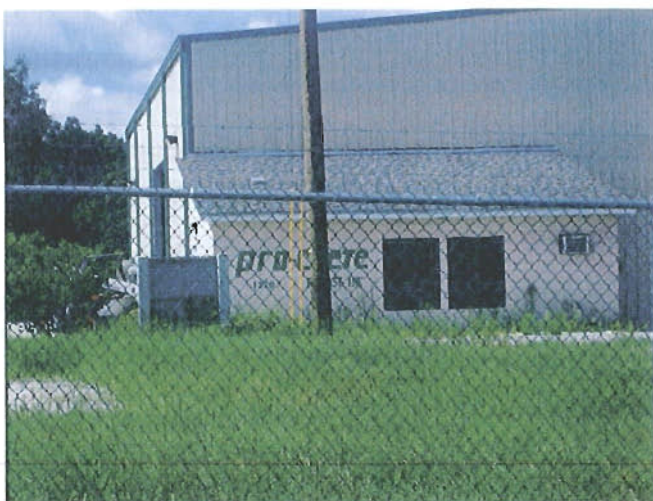
Photo ID No.3 7/14/11 11AM Close-up of main building and fence.