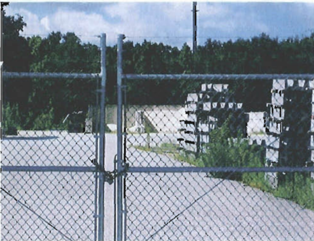
Photo ID No.7 7/14/11 11AM Close-up of blocks and sand piles. No parked cars, no apparent activity.