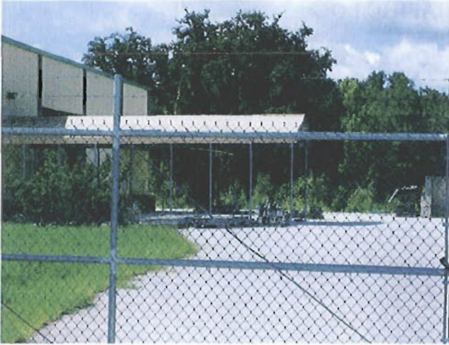
Photo ID No.5 7/14/11 11AM Back entrance to main building with closed and locked gate