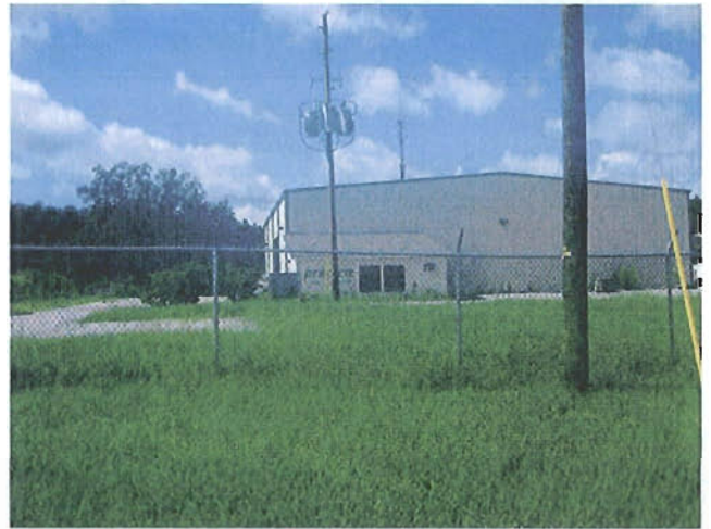
Photo ID No.2 7/14/11 11AM Barb-wire topped fence and main building.