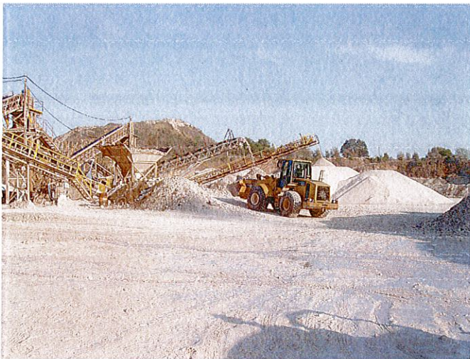
Photo ID No. / Date / Time: Picture 07 03-15-2011 Hopper and Conveyor Belt to Canica-Jaques Crusher