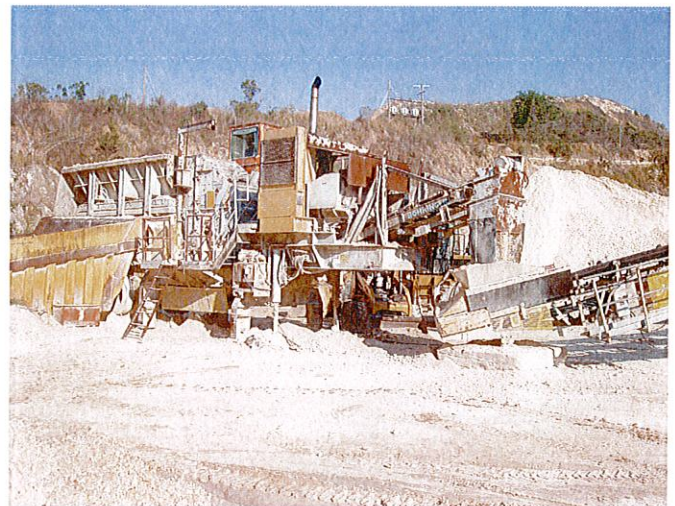
Photo ID No. / Date / Time: Picture 013 03-15-2011 Boehlinger Crusher and Drop to Belt Conveyor