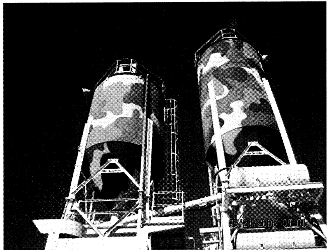
Photo ID No. / Date / Time: Inland Mat 032108 (2) Cement and flyash silos / 3/21/08 / 10:01