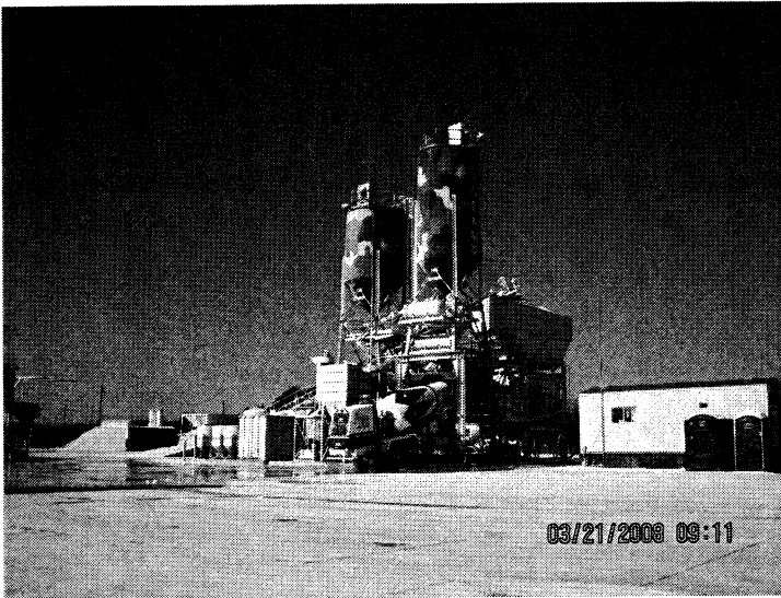
Photo ID No. / Date / Time: Inland Mat 032108 (6) – Left to right: flyash silo, cement silo, weigh hopper