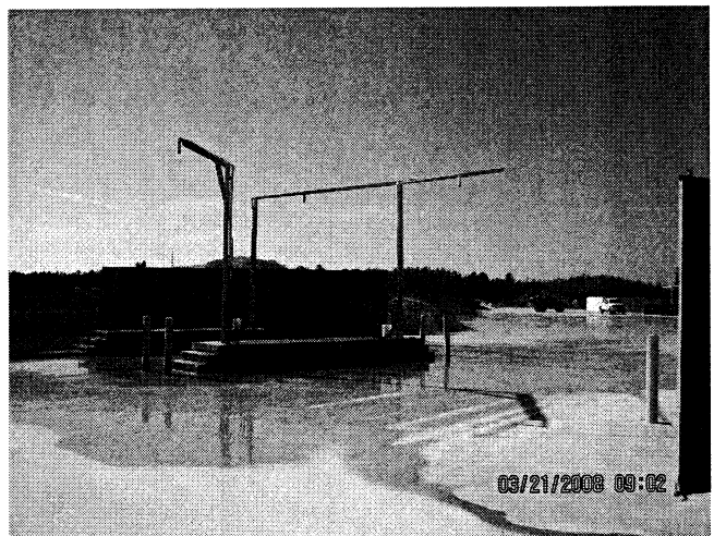
Photo ID No. / Date / Time: Inland Mat 032108 (4) Stock piles / 3/21/08 / 10:02