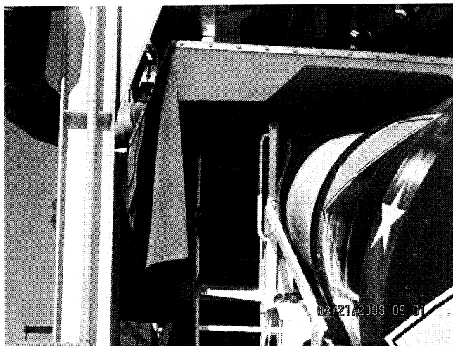
Photo ID No. / Date / Time: Inland Mat 032108 (1)/unloading pick up points /3/21/08/ 10:01