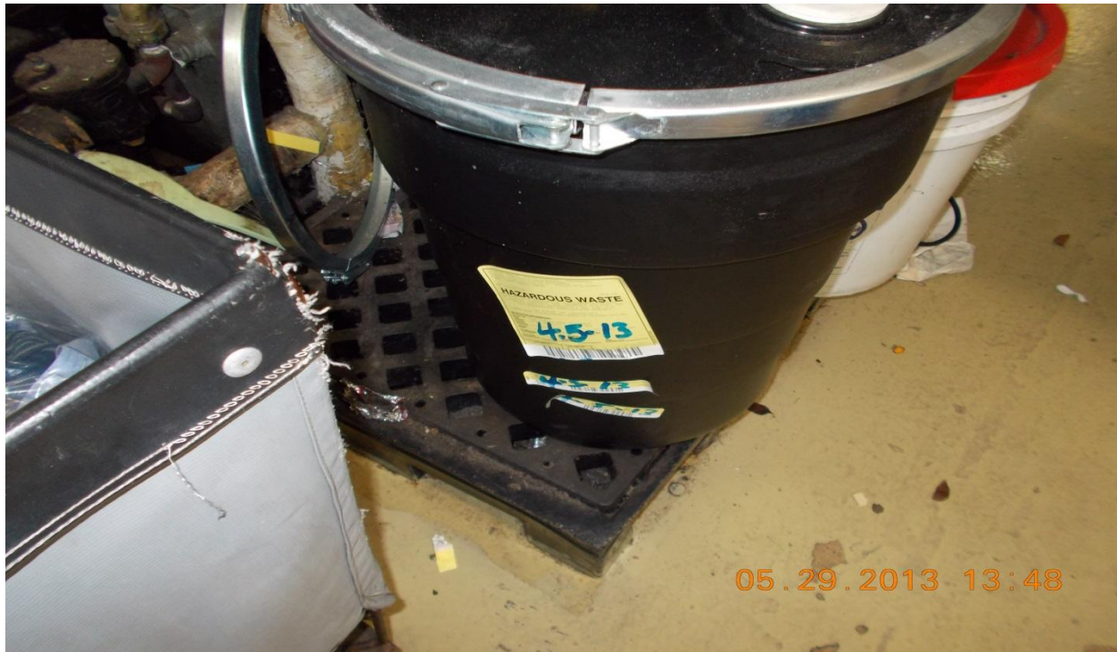
Photograph of drum of hazardous waste in secondary containment.