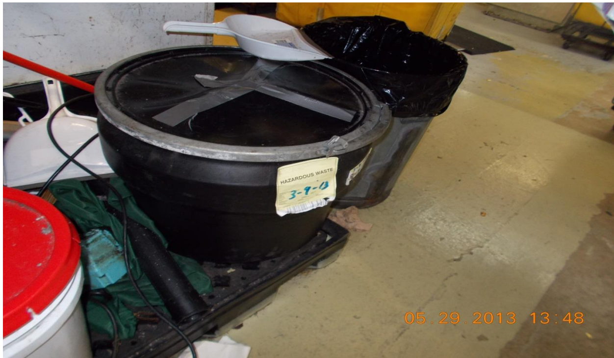
Photograph of drums of hazardous waste (filters) in secondary containment (accumulation date observed).