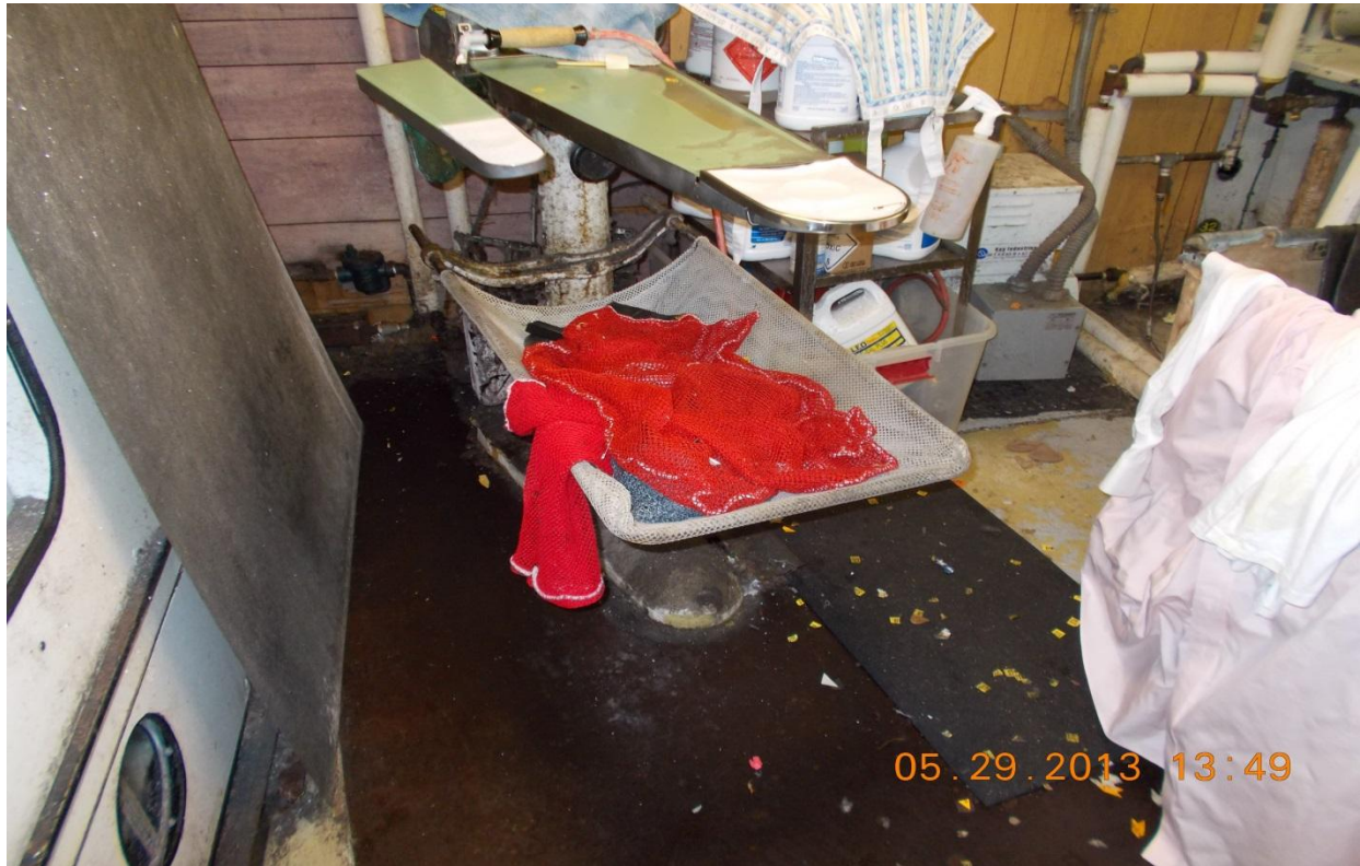
Photograph of spotting board area.