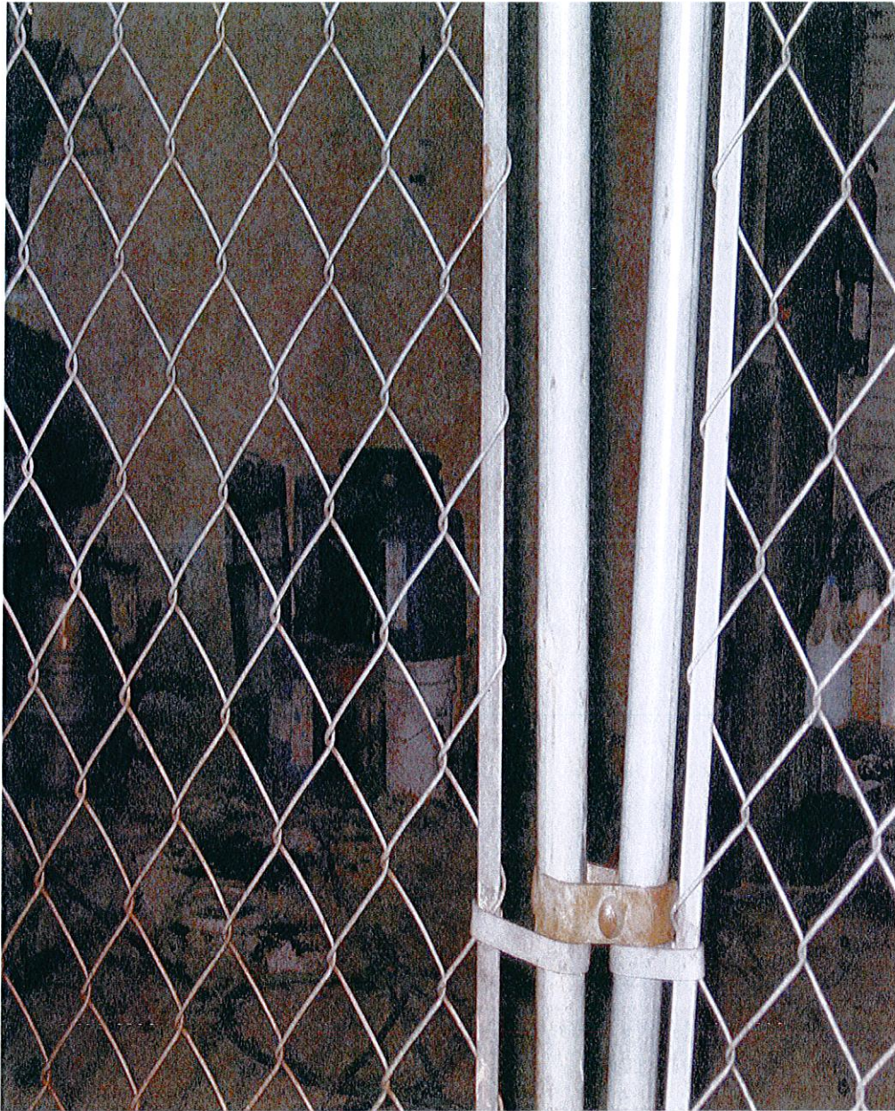
Photo ID No. / Date: 11/04/2010 / Time: 07:56:47 Picture: img_573 Facility White Wolf Custom Fac ID: 0530053

Facility Name: White Wolf Custom Facility ID No. 0530053