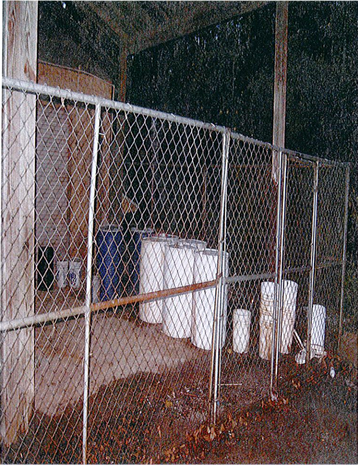
Photo ID No. / Date: 11/04/2010 / Time: 07:56:26 Picture: img 572 Facility White Wolf Custom Fac ID: 0530053

Facility Name: White Wolf Custom Facility ID No. 0530053