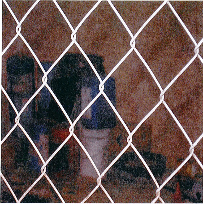
Photo ID No. / Date: 11/04/2010 / Time: 07:57:19 Picture: img 574 Facility White Wolf Custom Fac ID: 0530053

Facility Name: White Wolf Custom Facility ID No. 0530053