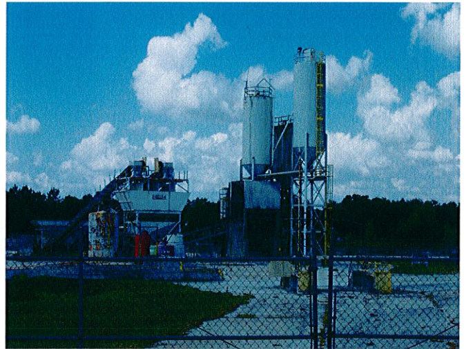
Photo ID No. / Date / Time: Picture 002 05-26-2011 11:15 Inactive silos and weigh hopper on facility grounds.