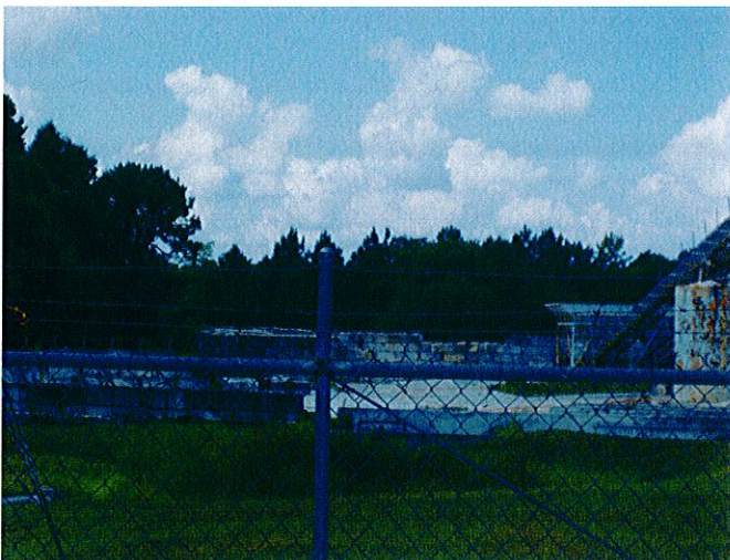
Photo ID No. / Date / Time: Picture 003 05-26-2011 11:15 Empty aggregate storage area behind fence.