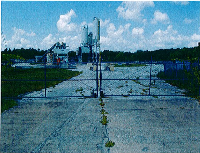
Photo ID No. / Date / Time: Picture 001 05-26-2011 11:15 Entrance to Inactive facility.