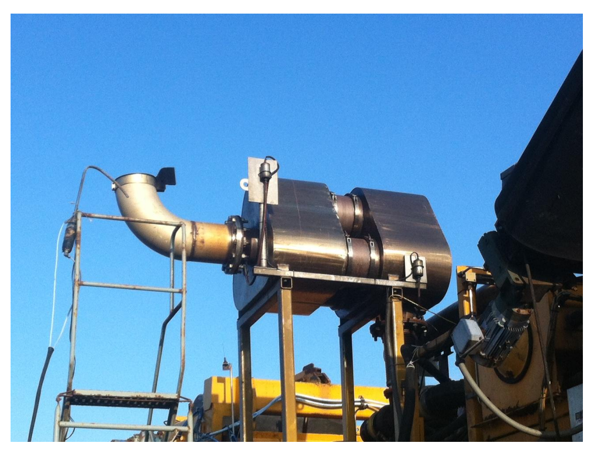
Catalytic Converter Mounted to Woody Waste Diesel Engine 4-3-2013