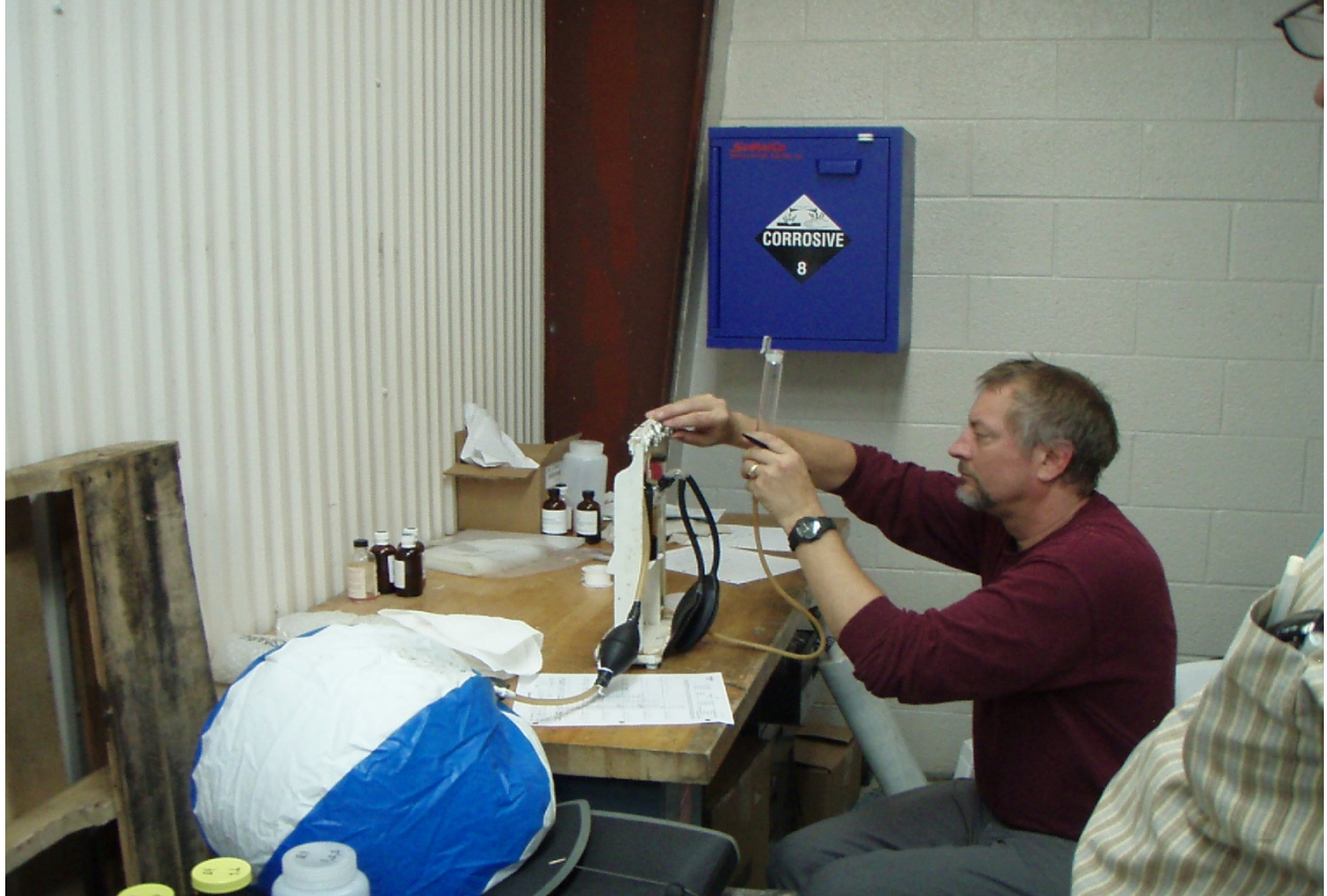
Orsat Analysis from Run 1