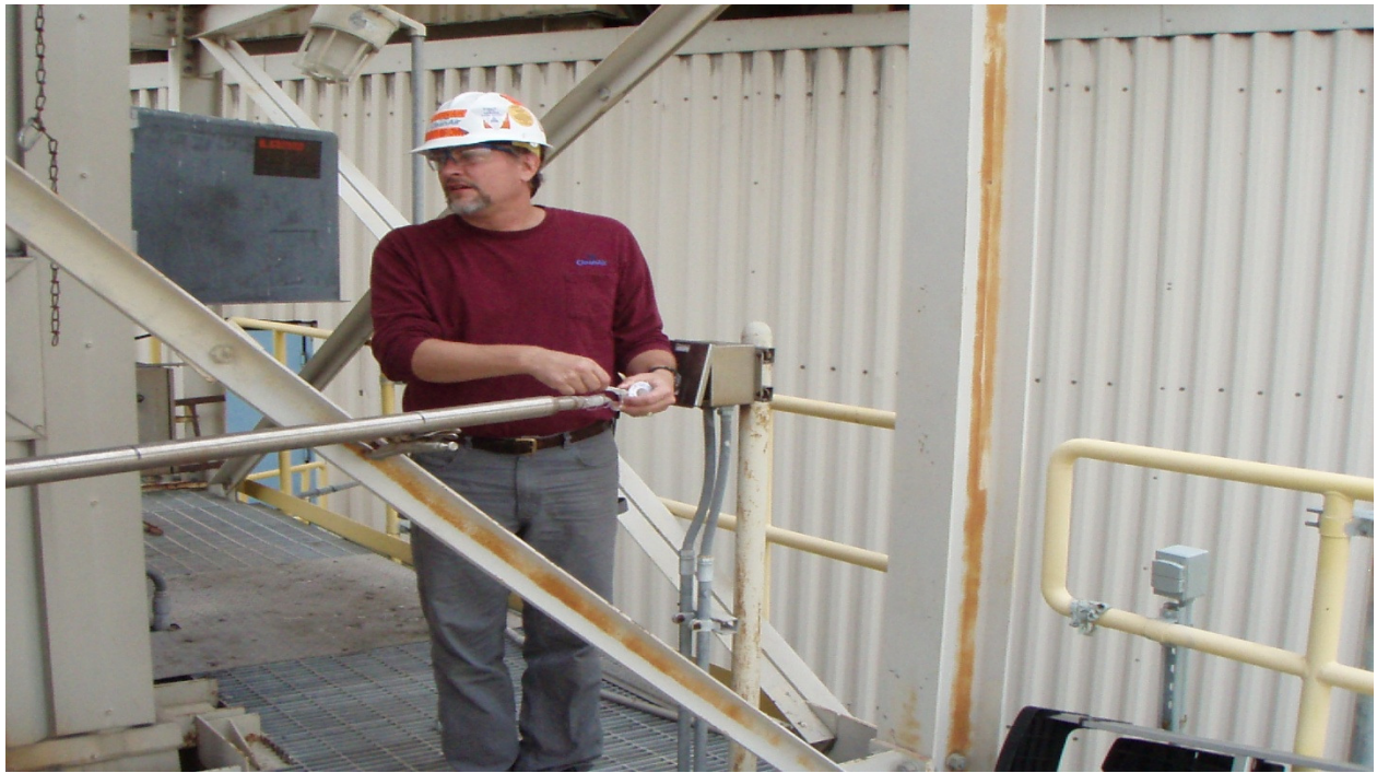
Leak Test, End of Run1