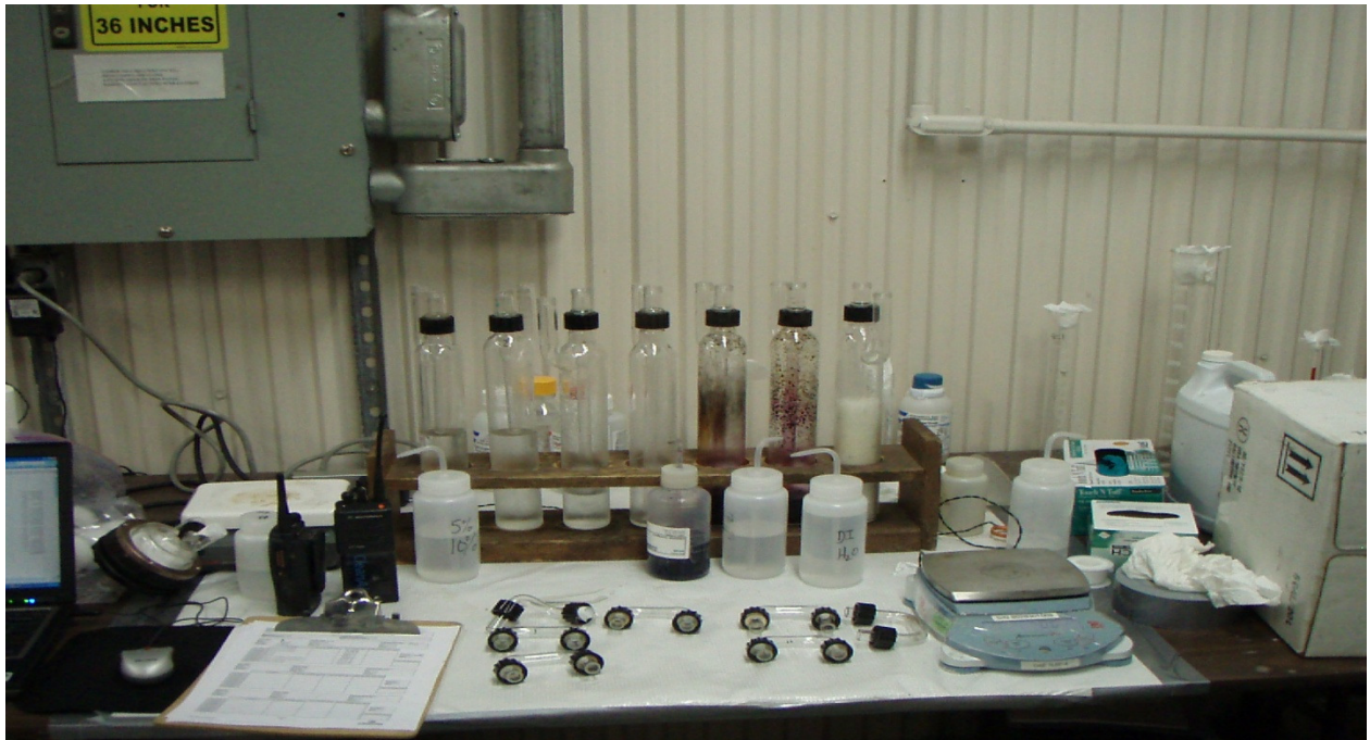
Impingers Ready to Process from Run 1