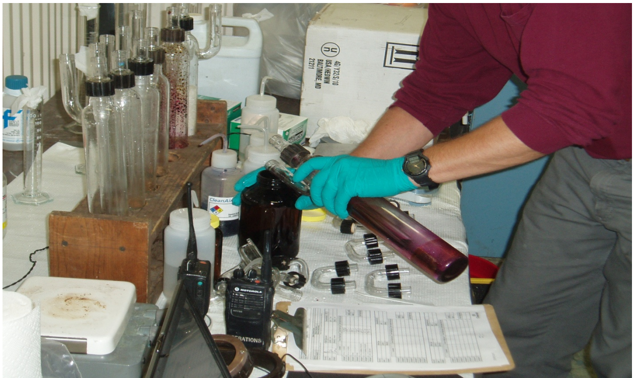
Impingers Being Processed from Run 1