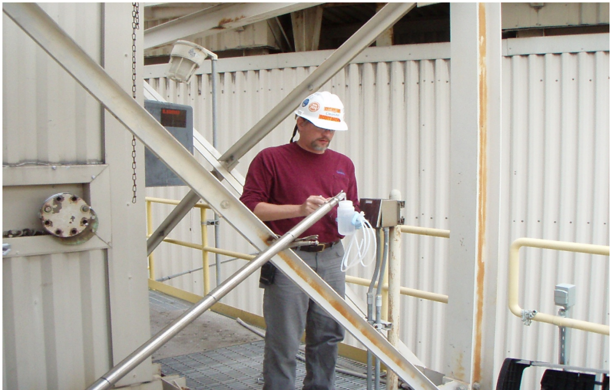
Cleaning Probe, End of Run 1