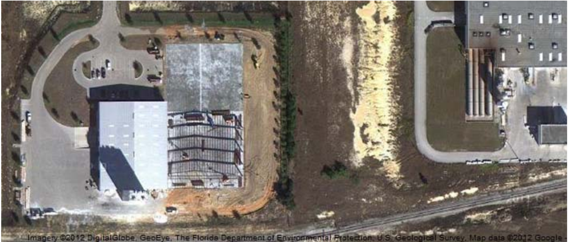
Figure 3: Zoomed-in image of map of Figure 2 above. Google Maps satellite image: Imagery copyrighted 2012 by DigitalGlobe, GeoEye, The Florida Department of Environmental Protection, and U.S. Geological Survey; Map Data copyrighted 2012 by Google; Map data does not appear to be current, possibly from 2010 or 2011 (Google watermarks on satellite image is difficult to read), since inspection On 05/11/2012 showed that East side of building (storage building) appeared to be completely constructed, whereas Google Maps image appears to show that the East part of building was under construction at the time that this satellite image was taken. This map was accessed on 07/05/2012 by Amaury Betancourt of the Florida Department of Environmental Protection