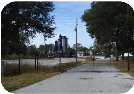
Showing front gate is locked