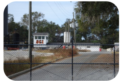
Closer shot of Ashalt plant control room and lab showing no Vehicles

Based on the inspection and the documentation provided, Mr. Young found the facility to be in compliance.