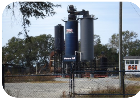
Closer shot of Ashalt plant showing no Vehicles