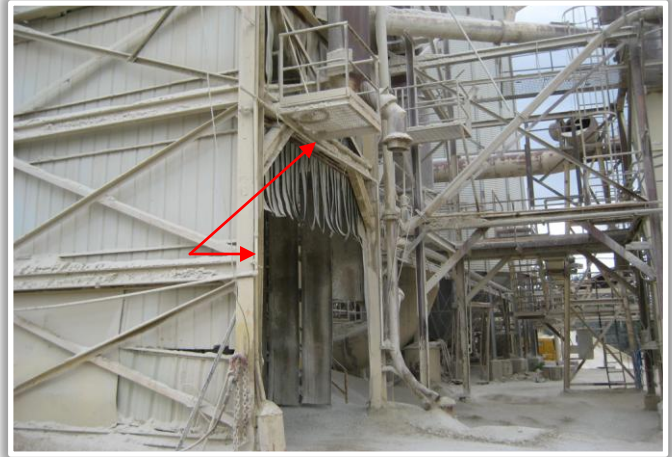
Photo 10: Side and frontal view of load out area showing inoperable sprinkler system.