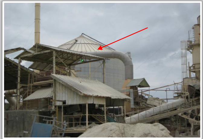
Photo 4: Tank #9 containing only dust from the collection system is located in the background.