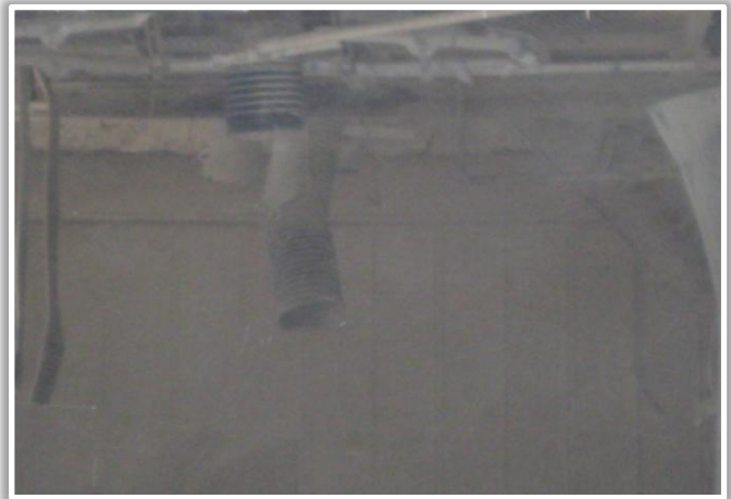
Photo 8: Close up view of the discharge shuttes inside the load out area.