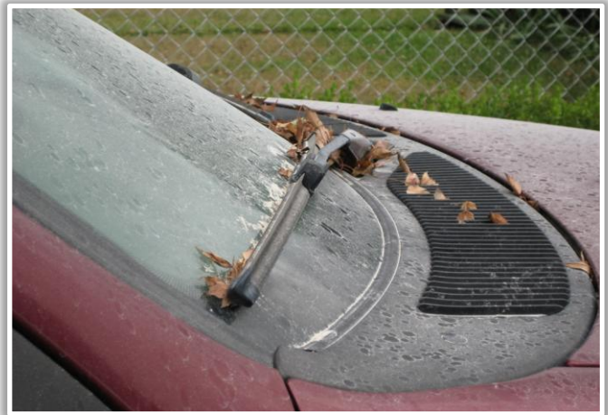
Photo 12: Accumulated clay-like material on the windshield/hood of Mr. Roland's vehicle.