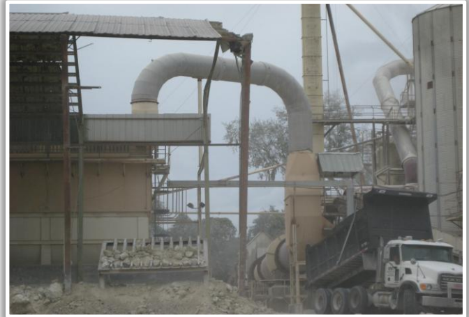
Photo 2: A dust cloud located in the middle of the facility which was observed upon entering the facility.