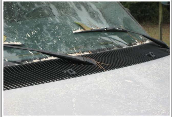
Photo 14: Accumulated clay-like substance on the windshield/hood of a neighbor's vehicle.