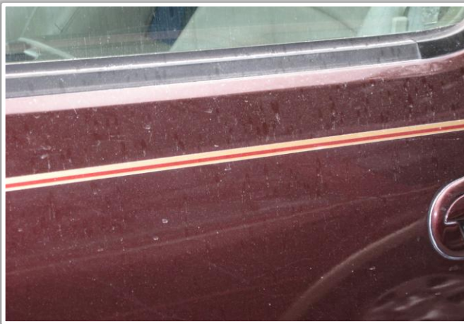
Photo 11: Accumulated clay-like material on the side of Mr. Roland's (complainant) vehicle.