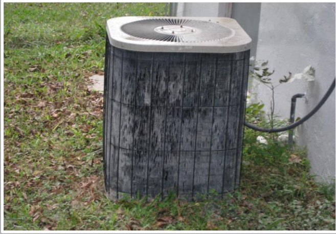
Photo 17: Accumulated clay-like substance covering the outside air conditioning unit of David & Lilia Kiefer.