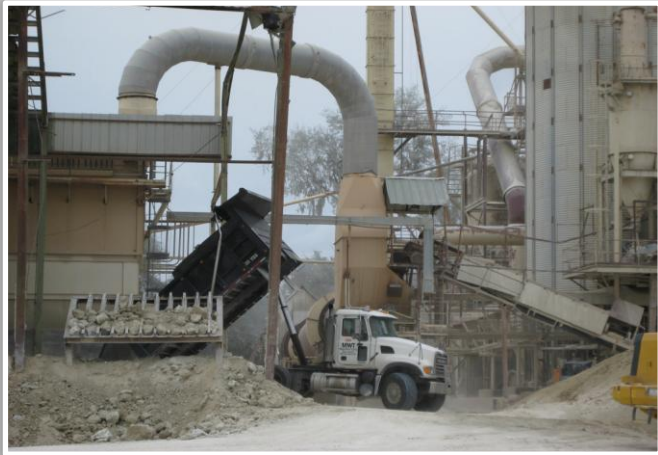
Photo 1: A dust cloud located in the middle of the facility which was observed upon entering the facility.