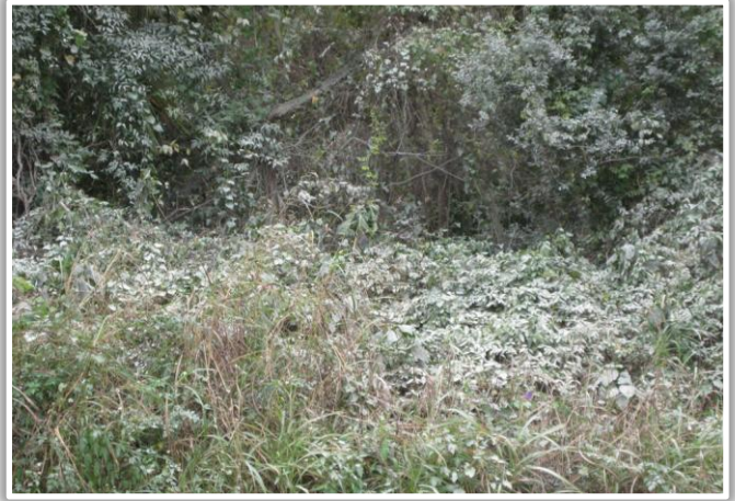
Photo 18: Accumulated clay-like substance covering the vegetation located directly across the road (CR 329) from MFM Industries.