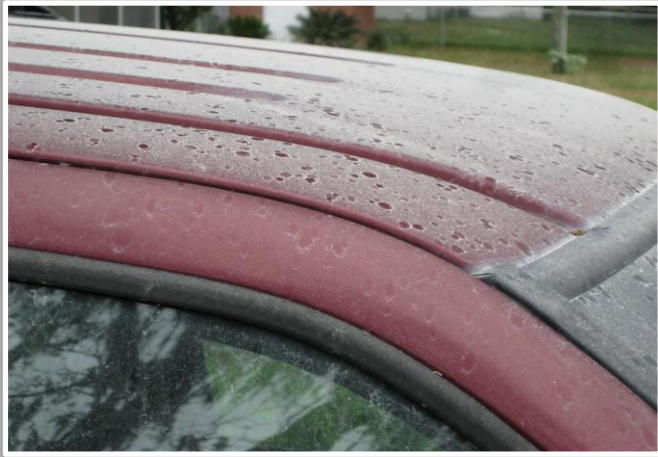
Photo 13: Accumulated clay-like substance on the top of Mr. Roland's vehicle.