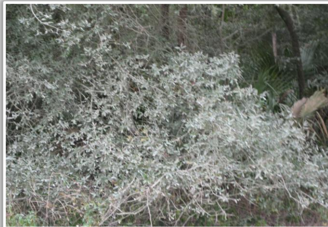
Photo 19: Accumulated clay-like substance covering the vegetation located directly across the road (CR 329) from MFM Industries.