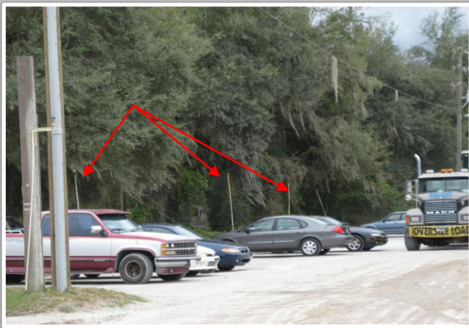
Photo 3: Approximately 10 ft vertical sprinklers in the background along the front end of parking area.